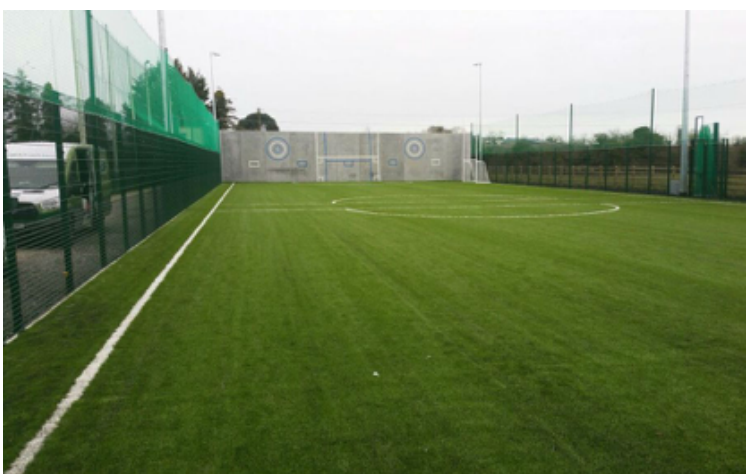
Clubs can access grants from Croke Park to improve facilities