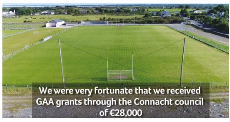
Kinvara in Galway are reaping the rewards of their hard work at redevelopment