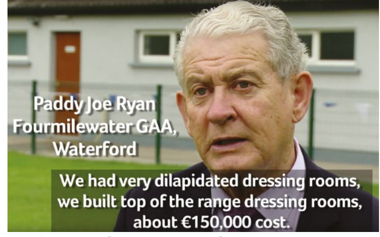
Fourmilewater in Waterford now have outstanding facilities