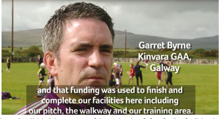
Kinvara GAA Club in Galway were one of thousands to benefit from funding for Club redevelopment